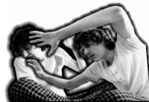
Anything to ruin each other.