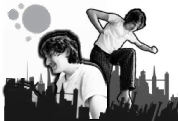
Us humans build, and destroy.