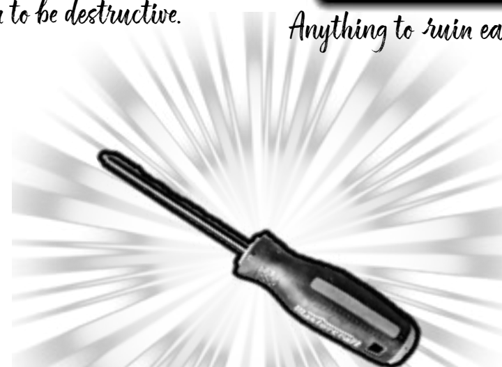
But the light of building remains.