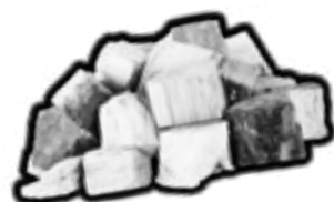
It either builds, or destroys.