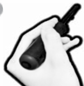
It can put things together or take things apart.