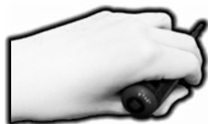
The use of it can change