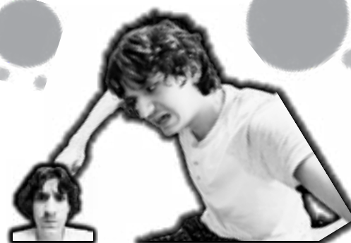
Humans prefer to be destructive.