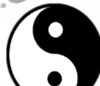
It's the sophisticated balance of life.